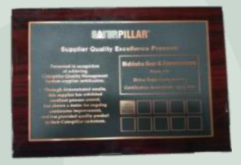
"SQEP - Bronze certification" from Caterpillar