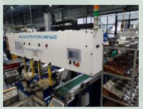
AUTO ROLL TESTING