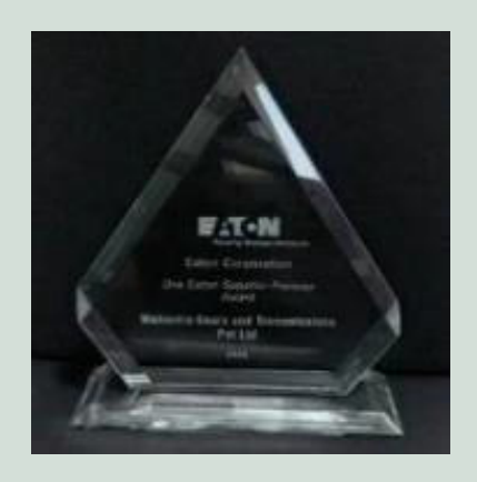
One Eaton Supplier Premier Award for superior performance in quality and delivery

CIE India's Gears division has received many awards and recognition from its customers for its exemplary performance as a supplier with best in-house systems. We are proud to present some of the awards as a result of our employees hard work and dedication: