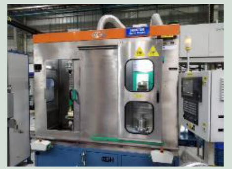
INDUCTION HEAT TREATMENT