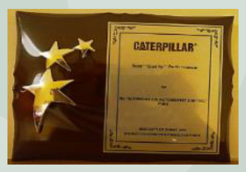
"Best Quality Performance" Award - 2019