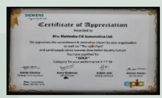
Certificate of appreciation from Siemens for Zero Defect Quality Culture